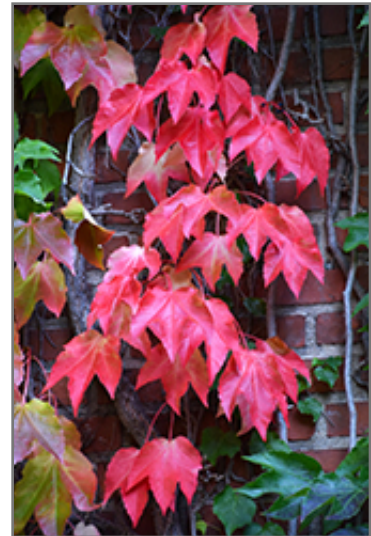
Boston Ivy in fall