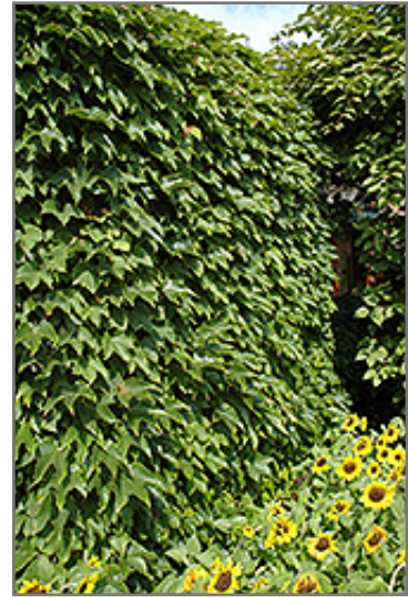
Boston Ivy

This woody vine does best in full sun to partial shade. It is very adaptable to both dry and moist locations, and should do just fine under average home landscape conditions. It is considered to be drought-tolerant, and thus makes an ideal choice for xeriscaping or the moisture-conserving landscape. It is not particular as to soil type or pH, and is able to handle environmental salt. It is highly tolerant of urban pollution and will even thrive in inner city environments. This species is not originally from North America.