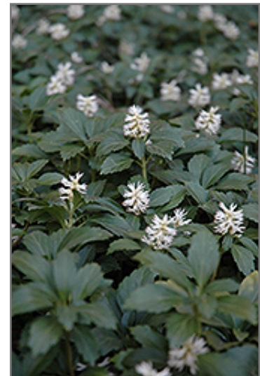
Japanese Spurge flowers