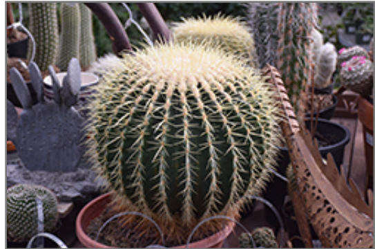
Golden Barrel Cactus in full

Golden Barrel Cactus is a succulent evergreen plant. It is a member of the cactus family, which are grown primarily for their characteristic shapes, their interesting features and textures, and their high tolerance for hot, dry growing environments. Like all cacti, it doesn't actually have leaves, but rather modified succulent stems that comprise the bulk of the plant, and which are designed to hold water for long periods of time. This particular cactus is valued for its distinctive barrel shape, and usually grows as a single spiny ribbed green stem. This plant has yellow cup-shaped flowers held atop the stems from late spring to early summer, which are interesting on close inspection.