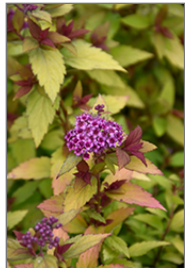
Poprocks Rainbow Fizz Spirea flowers