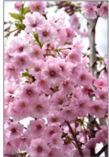
First Blush Flowering Cherry flowers