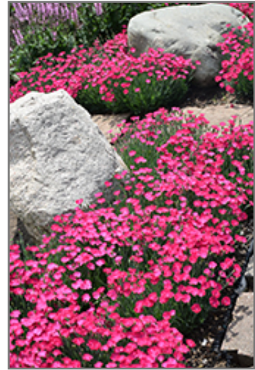
Paint The Town Magenta Pinks in bloom

Paint The Town Magenta Pinks is an herbaceous evergreen perennial with a mounded form. It brings an extremely fine and delicate texture to the garden composition and should be used to full effect.