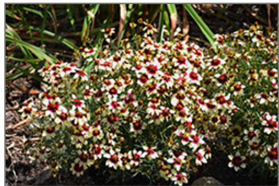
Sizzle And Spice Red Hot Vanilla Tickseed in bloom