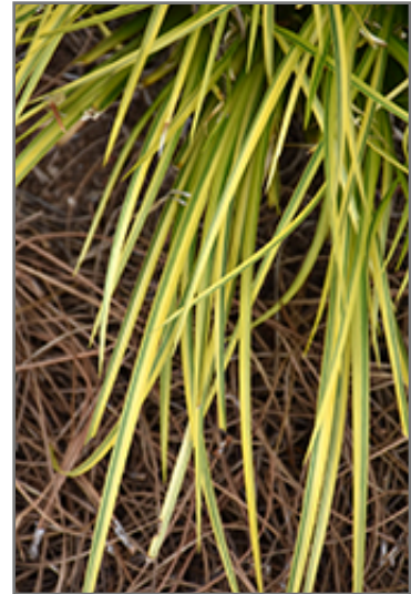
EverColor Everoro Japanese Sedge foliage

EverColor Everoro Japanese Sedge is recommended for the following landscape applications;