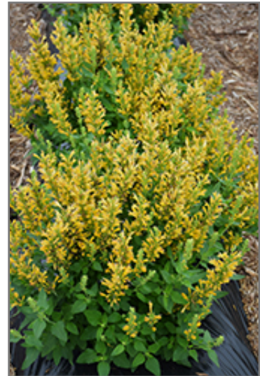
Poquito Butter Yellow Hyssop in bloom