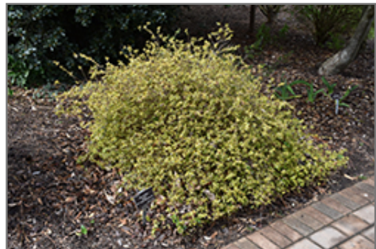
Twist of Orange Glossy Abelia