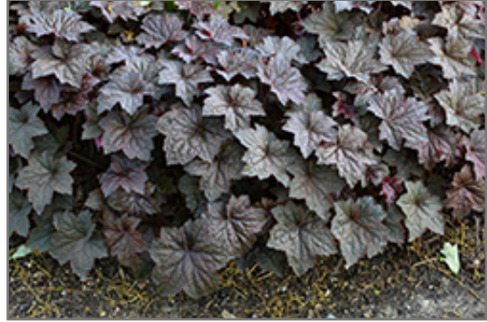
Palace Purple Coral Bells

Palace Purple Coral Bells is a fine choice for the garden, but it is also a good selection for planting in outdoor pots and containers. With its upright habit of growth, it is best suited for use as a 'thriller' in the 'spiller-thriller-filler' container combination; plant it near the center of the pot, surrounded by smaller plants and those that spill over the edges. Note that when growing plants in outdoor containers and baskets, they may require more frequent waterings than they would in the yard or garden.