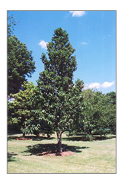
Cucumber Magnolia

This tree does best in full sun to partial shade. It requires an evenly moist well-drained soil for optimal growth, but will die in standing water. It is not particular as to soil type, but has a definite preference for acidic soils. It is quite intolerant of urban pollution, therefore inner city or urban streetside plantings are best avoided. Consider applying a thick mulch around the root zone in winter to protect it in exposed locations or colder microclimates. This species is native to parts of North America.