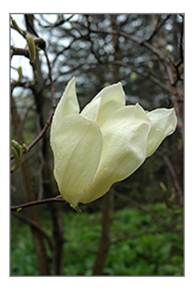
Cucumber Magnolia flowers