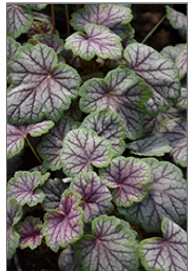
Green Spice Coral Bells foliage