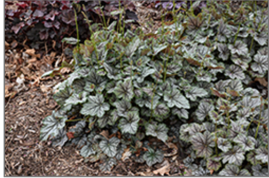
Green Spice Coral Bells

Green Spice Coral Bells will grow to be about 10 inches tall at maturity extending to 24 inches tall with the flowers, with a spread of 12 inches. When grown in masses or used as a bedding plant, individual plants should be spaced approximately 10 inches apart. Its foliage tends to remain low and dense right to the ground. It grows at a medium rate, and under ideal conditions can be expected to live for approximately 10 years. As an evergreen perennial, this plant will typically keep its form and foliage year-round.