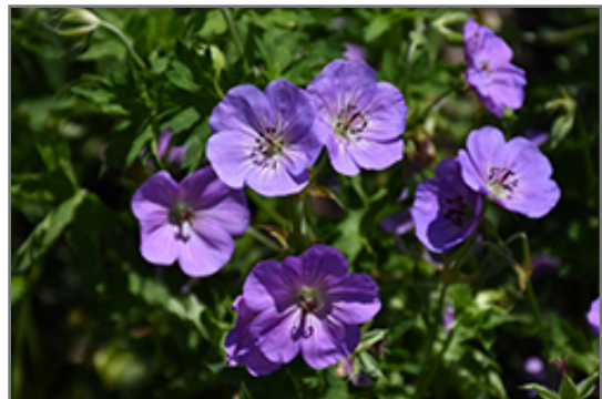
Azure Rush Cranesbill flowers