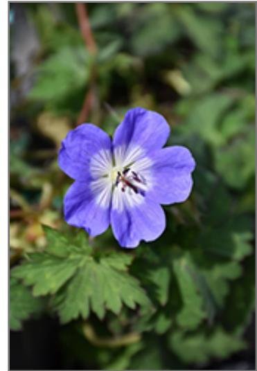
Azure Rush Cranesbill flowers

Azure Rush Cranesbill is recommended for the following landscape applications;