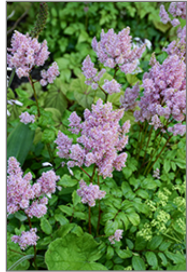
Ice Cream Astilbe flowers

Ice Cream Astilbe is recommended for the following landscape applications;