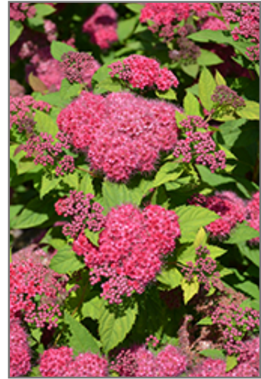
Double Play Red Spirea flowers

Double Play Red Spirea is recommended for the following landscape applications;