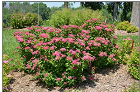
Double Play Red Spirea in bloom