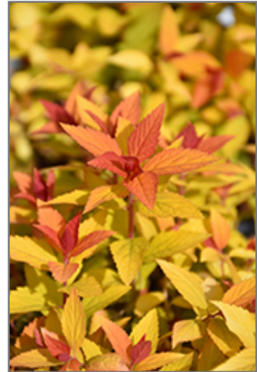
Double Play Candy Corn Spirea foliage

Double Play Candy Corn Spirea is recommended for the following landscape applications;