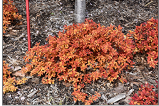
Double Play Candy Corn Spirea

This shrub should only be grown in full sunlight. It prefers to grow in average to moist conditions, and shouldn't be allowed to dry out. It is not particular as to soil type or pH. It is highly tolerant of urban pollution and will even thrive in inner city environments. This is a selected variety of a species not originally from North America.