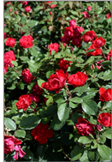
Oso Easy Double Red Rose flowers

This shrub should only be grown in full sunlight. It does best in average to evenly moist conditions, but will not tolerate standing water. It is not particular as to soil type or pH. It is somewhat tolerant of urban pollution. This particular variety is an interspecific hybrid.