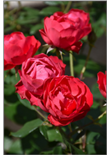
Oso Easy Double Red Rose flowers

Oso Easy Double Red Rose is recommended for the following landscape applications;