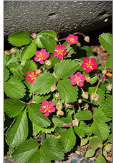
Lipstick Strawberry flowers

Lipstick Strawberry has masses of beautiful cherry red daisy flowers with yellow eyes along the stems from late spring to early summer, which are most effective when planted in groupings. Its tomentose round compound leaves remain green in color throughout the season. It features an abundance of magnificent red berries from mid spring to mid fall.