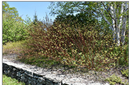
Bailey's Red Twig Dogwood in spring