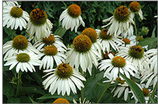
White Swan Coneflower flowers

This is a relatively low maintenance plant, and is best cleaned up in early spring before it resumes active growth for the season. It is a good choice for attracting butterflies to your yard, but is not particularly attractive to deer who tend to leave it alone in favor of tastier treats. It has no significant negative characteristics.