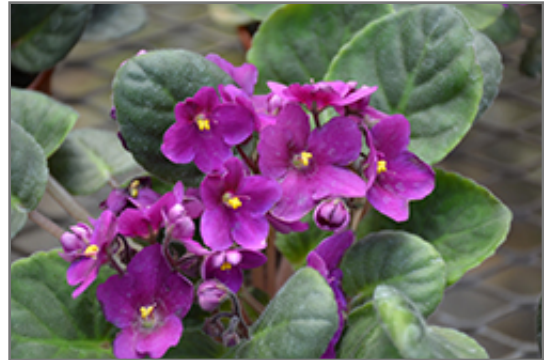
Hybrid Purple African Violet flowers