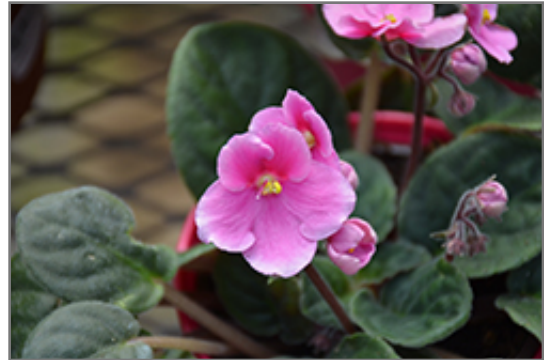
Hybrid Pink African Violet flowers