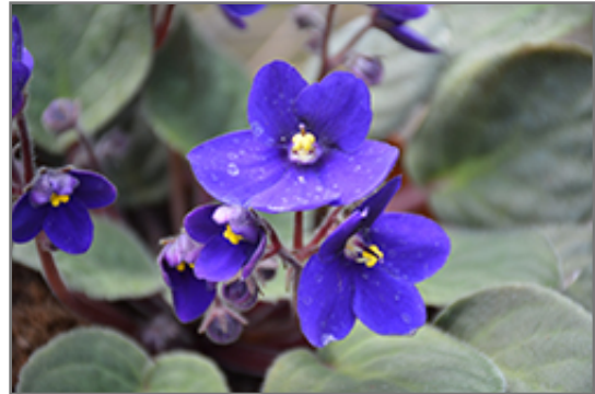
Hybrid Blue African Violet flowers