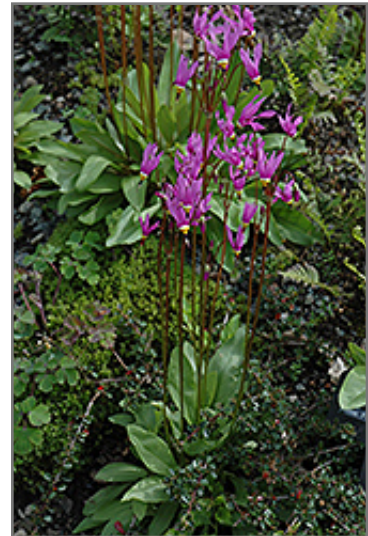
Shooting Star in bloom