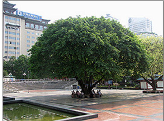
Indian Laurel Fig

This is a multi-stemmed evergreen houseplant with a more or less rounded form. This plant may benefit from an occasional pruning to look its best.