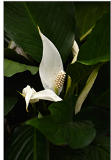
Peace Lily flowers