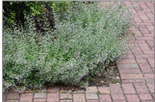
Blue Cloud Dwarf Calamint in bloom

Blue Cloud Dwarf Calamint is recommended for the following landscape applications;