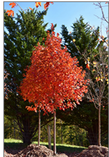
Flashfire Sugar Maple in fall