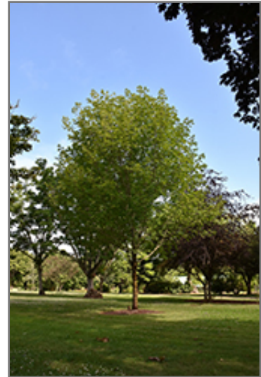
Flashfire Sugar Maple

This tree should only be grown in full sunlight. It prefers to grow in average to moist conditions, and shouldn't be allowed to dry out. It is not particular as to soil pH, but grows best in rich soils. It is somewhat tolerant of urban pollution. This is a selection of a native North American species.