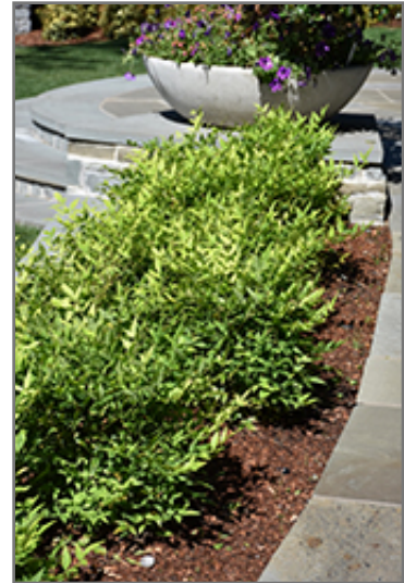
Lemon Lime Nandina