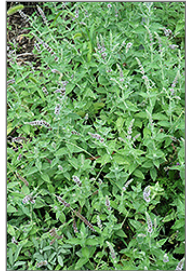
Pennyroyal in bloom