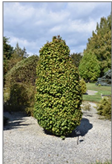
Columnaris Nana Hornbeam