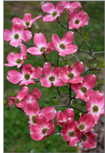
Red Flowering Dogwood flowers

Red Flowering Dogwood is recommended for the following landscape applications;