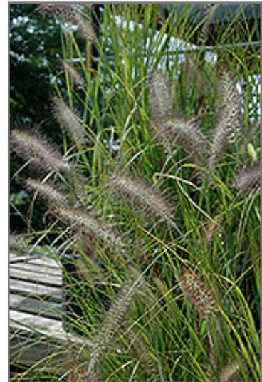
Cassian Dwarf Fountain Grass flowers