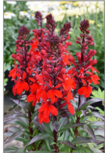
Starship Scarlet Lobelia flowers

Starship Scarlet Lobelia is recommended for the following landscape applications;