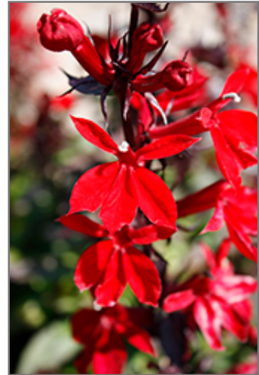
Starship Scarlet Lobelia flowers

Starship Scarlet Lobelia is a fine choice for the garden, but it is also a good selection for planting in outdoor pots and containers. With its upright habit of growth, it is best suited for use as a 'thriller' in the 'spiller-thriller-filler' container combination; plant it near the center of the pot, surrounded by smaller plants and those that spill over the edges. Note that when growing plants in outdoor containers and baskets, they may require more frequent waterings than they would in the yard or garden.