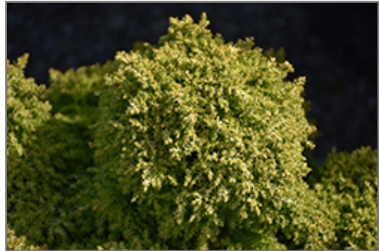
Twinkle Toes Japanese Cedar foliage