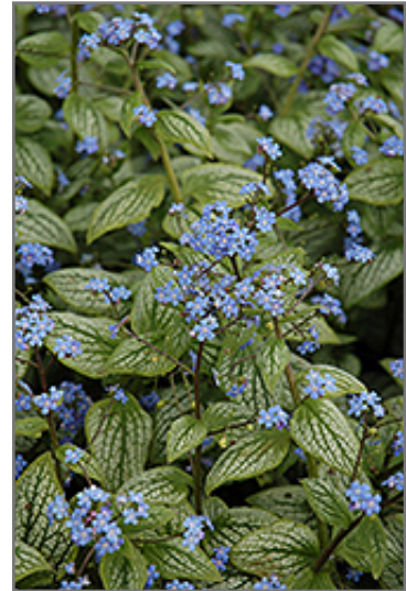
Silver Heart Bugloss flowers