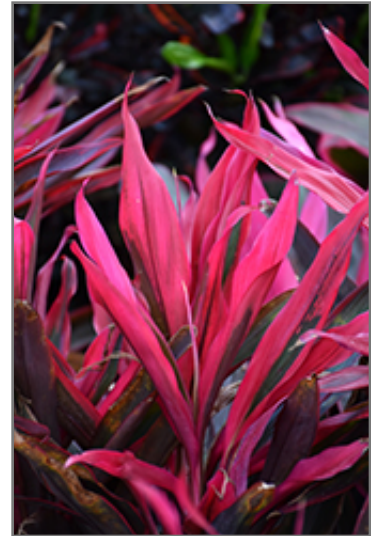
Maria Cordyline foliage

This plant does best in full sun to partial shade. It does best in average to evenly moist conditions, but will not tolerate standing water. It is not particular as to soil type or pH, and is able to handle environmental salt. It is somewhat tolerant of urban pollution. This particular variety is an interspecific hybrid.