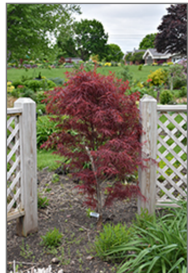
Hubb's Red Willow Japanese Maple