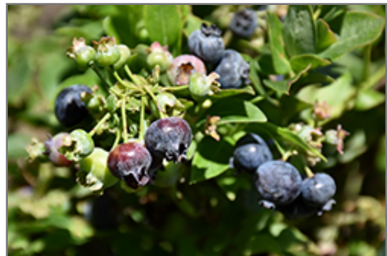
Jelly Bean Blueberry fruit