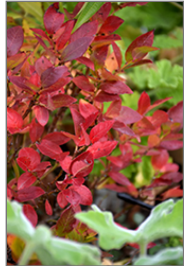
Jelly Bean Blueberry in fall

Jelly Bean Blueberry features dainty clusters of white bell-shaped flowers with shell pink overtones hanging below the branches in mid spring. It has red-variegated green foliage. The glossy oval leaves turn an outstanding red in the fall. It features an abundance of magnificent blue berries in mid summer.