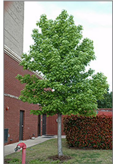
Happidaze Sweet Gum

This tree should only be grown in full sunlight. It prefers to grow in average to moist conditions, and shouldn't be allowed to dry out. It is very fussy about its soil conditions and must have rich, acidic soils to ensure success, and is subject to chlorosis (yellowing) of the foliage in alkaline soils. It is somewhat tolerant of urban pollution. This is a selection of a native North American species.