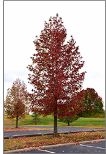
Happidaze Sweet Gum in fall