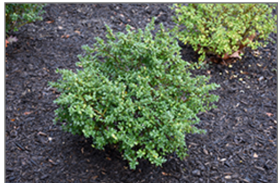
Green Lustre Japanese Holly