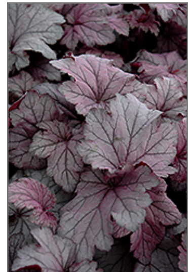
Spellbound Coral Bells foliage