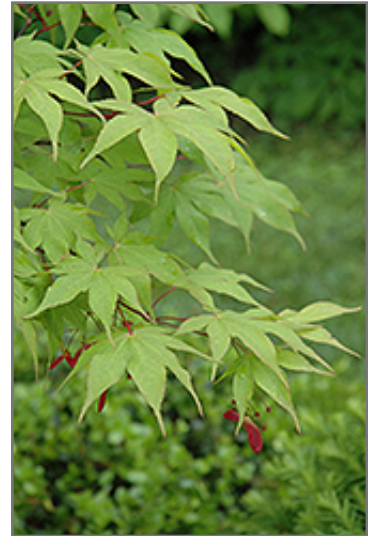
Osakazuki Japanese Maple foliage

This tree does best in full sun to partial shade. You may want to keep it away from hot, dry locations that receive direct afternoon sun or which get reflected sunlight, such as against the south side of a white wall. It prefers to grow in average to moist conditions, and shouldn't be allowed to dry out. It is not particular as to soil pH, but grows best in rich soils. It is somewhat tolerant of urban pollution, and will benefit from being planted in a relatively sheltered location. Consider applying a thick mulch around the root zone in winter to protect it in exposed locations or colder microclimates. This is a selected variety of a species not originally from North America.