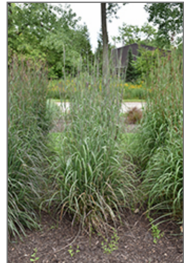
Indian Warrior Bluestem in bloom