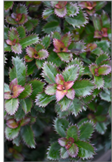
Scallywag Holly foliage