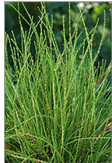
Franky Boy Arborvitae foliage