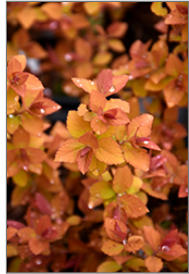
Double Play Big Bang Spirea foliage

This shrub should only be grown in full sunlight. It prefers to grow in average to moist conditions, and shouldn't be allowed to dry out. It is not particular as to soil type or pH. It is highly tolerant of urban pollution and will even thrive in inner city environments. This particular variety is an interspecific hybrid.