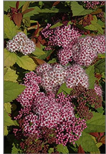
Double Play Big Bang Spirea flowers

Double Play Big Bang Spirea is recommended for the following landscape applications;