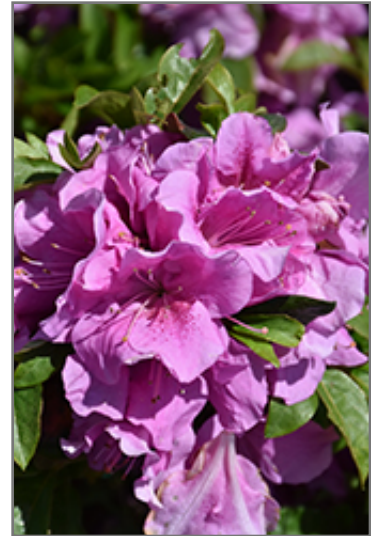
Encore Autumn Lilac Azalea flowers