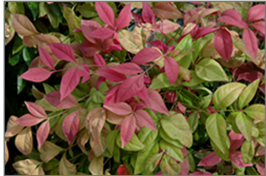
Blush Pink Nandina foliage

Blush Pink Nandina is recommended for the following landscape applications;